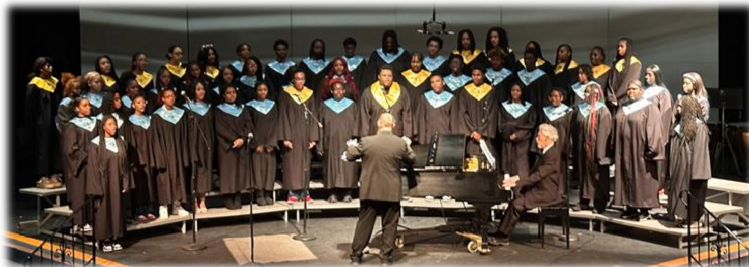
TR/TW Choir performs at SSC music student's recital