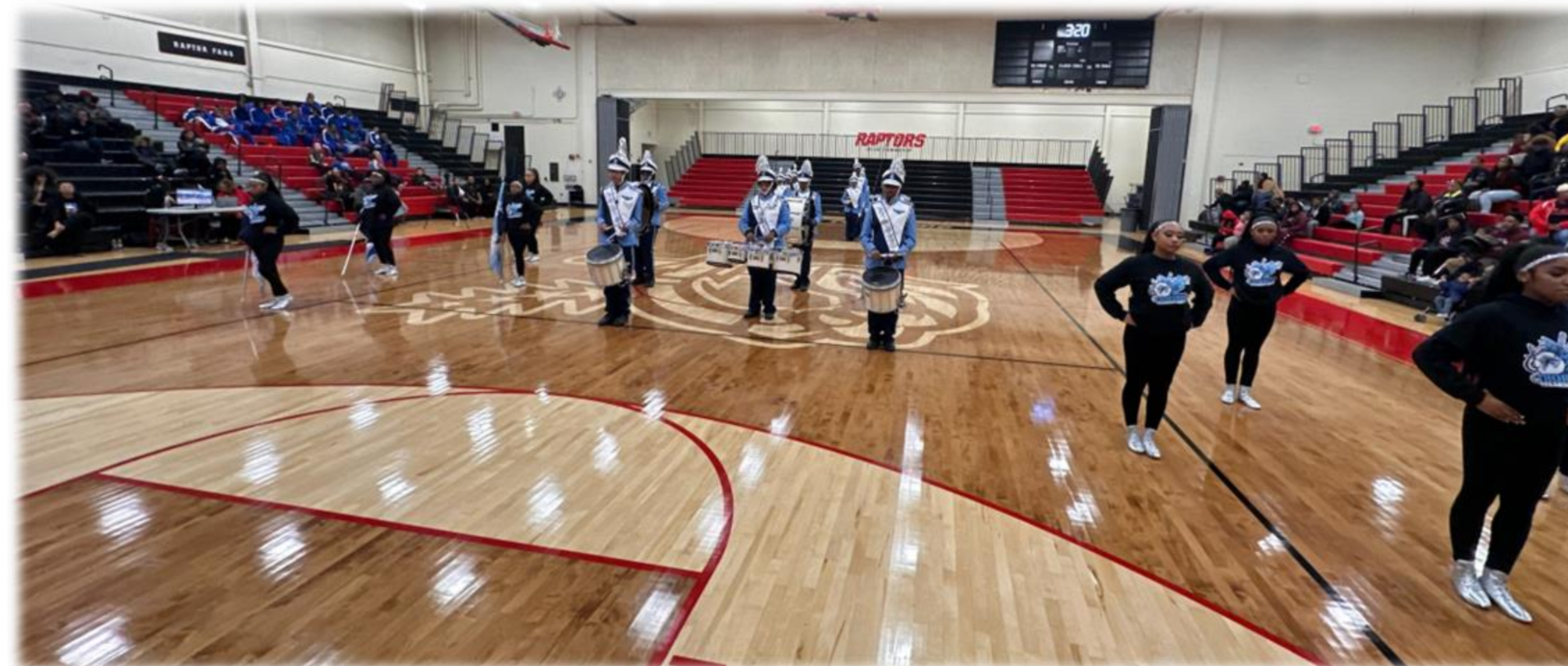
TR Band performance at Richton Park's Veterans Day Parade